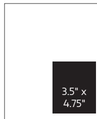
1/4 Page Vertical